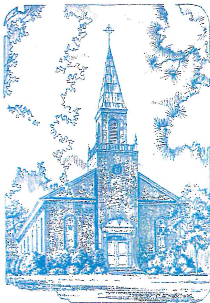
Culdee Presbyterian Church